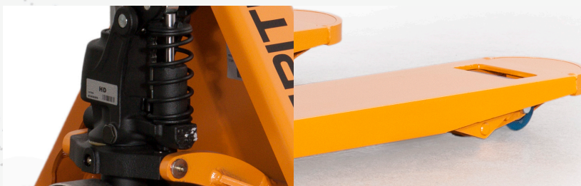
Heavy duty hydraulic pump