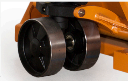
Solid steel wheels and rollers

Hour after hour. Day after day. Year after year. The solid steel wheels, rollers and heavy hydraulic pump withstand the most demanding applications.