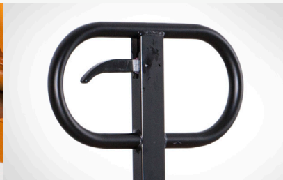
Ergonomic loop handle